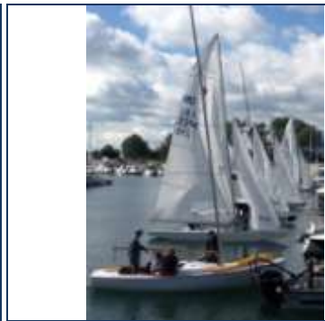
Star fleet prepares to depart Montrose Harbor for the 2013 IV District Championship.